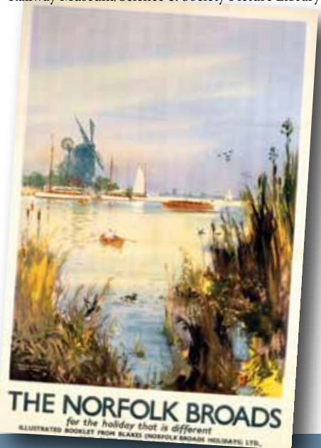
Railway poster