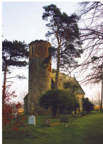
St Mary's Church, Fishley