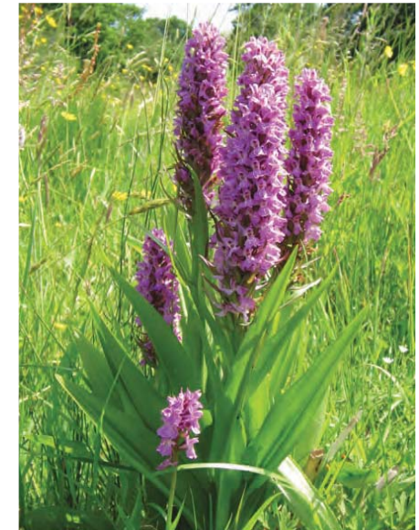
Orchids on Thwaite Common