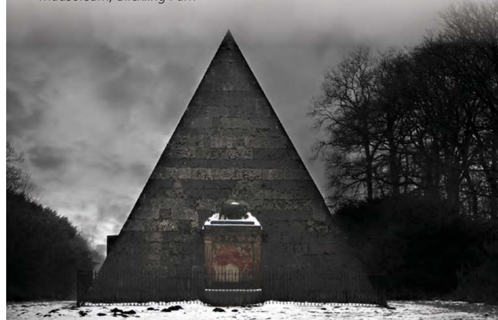
Mausoleum, Blickling Park