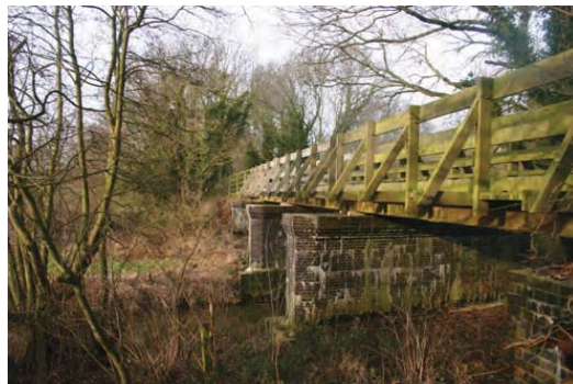
Weavers' Way over North Walsham and Dilham Canal

straight on along a track, signed as a restricted byway, which leads to an old farmyard. Just past the buildings and at the edge of the hardstanding, a public footpath is waymarked to the right, heading across a large open field towards the village and church.