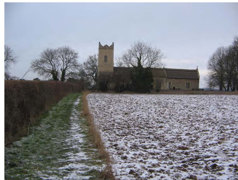
St Edmund's Church, Thurne