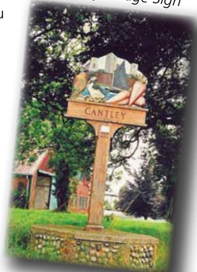
Cantley Village Sign