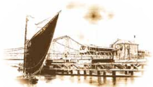
Wherry at Reedham

13 At the road, turn right to walk over the railway bridge. From this bridge you will have excellent views over the marshes, of the swing bridge, railway line and the River Yare.