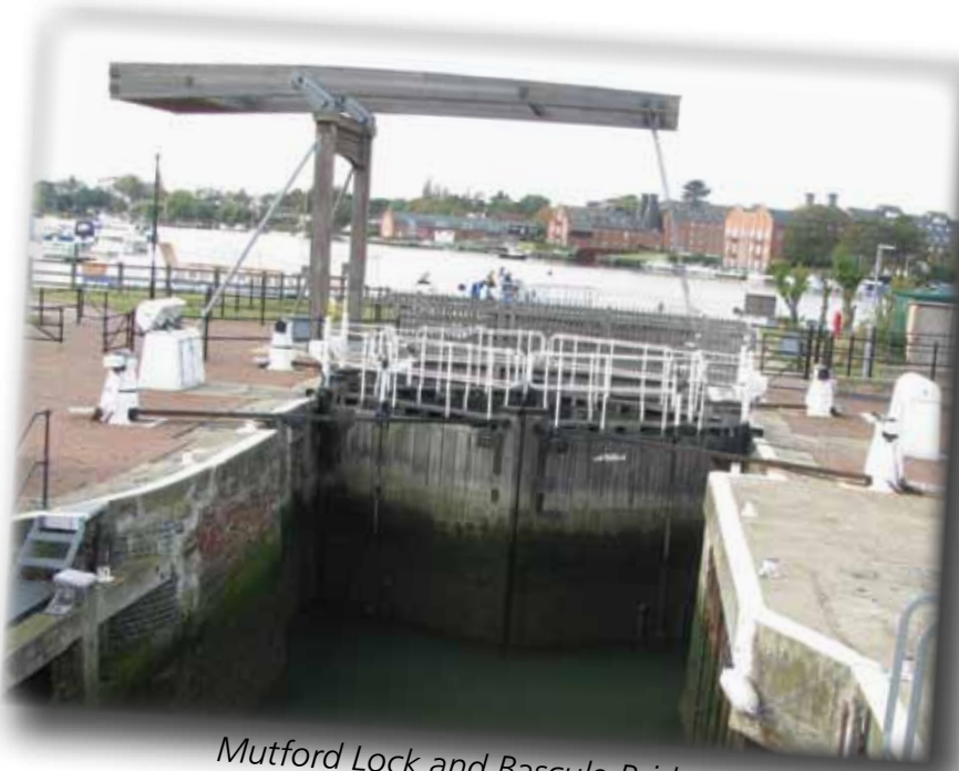
Mutford Lock and Bascule Bridge