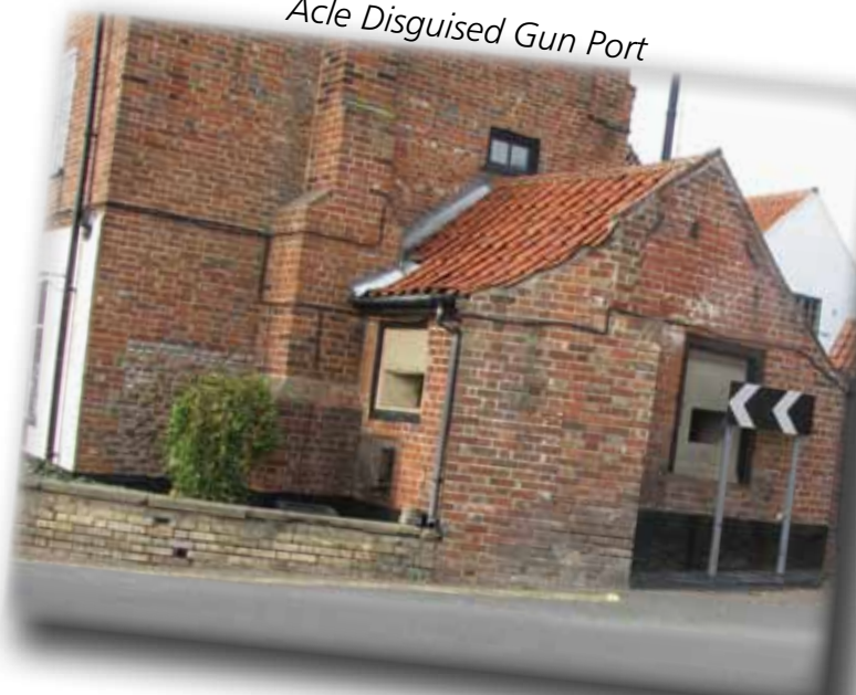
Acle Disguised Gun Port