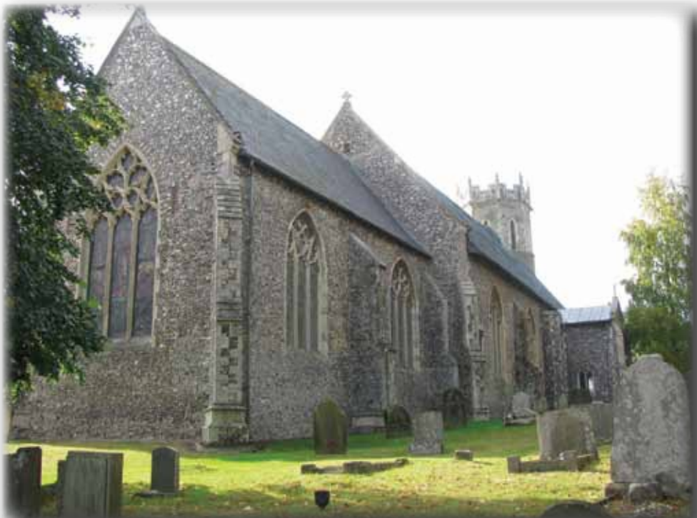
St Edmund's Church, Acle