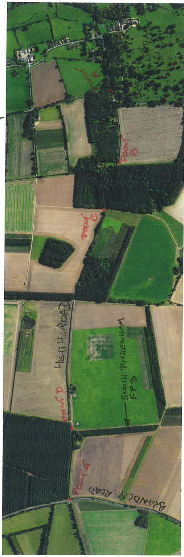
FIGURE 1. ZOOM EARTH SATELLITE PHOTOGRAPH OF HEATH ROAD, SOUTH PICKENHAM, 2019

THE MAJOR POINTS ACROSS THE ROUTE ARE (A) POINT A AT INTERSECTION WITH SOUTH PICKENHAM ROAD AT TF 85320410; POINT B AT THE DRIVEWAY TO THE SHOOTING LODGE AT TF 84900408; POINT C AT THE TURNOFF TO THE FIELD BARN AT TF 84660414; AND POINT D AT THE INTERSECTION WITH SOUTH PICKENHAM F.P.3 AT TF 83290428; AND AT THE ENTRANCE ON BRANDON ROAD AT TF 82850428.