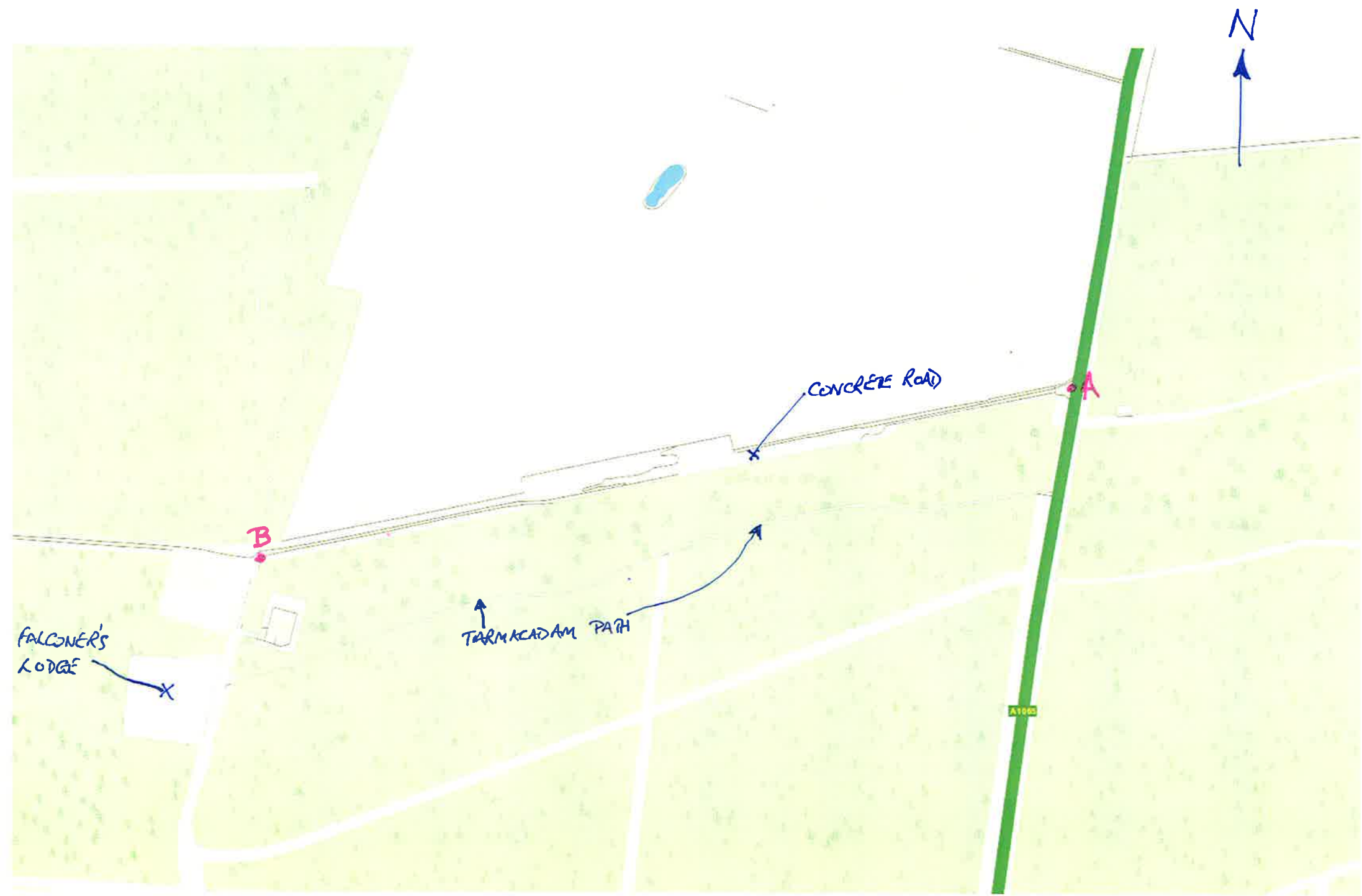
FIGURE 2. N.C.C. NORFOLK HIGHWAYS T.R.O.W. GAZETTEER, 2020 - CONCRETE ROAD, HIGH ASH

A- ENTRANCE ON BLANDON ROAD B- EXIT ON LONG GALLER, HIGH ASH