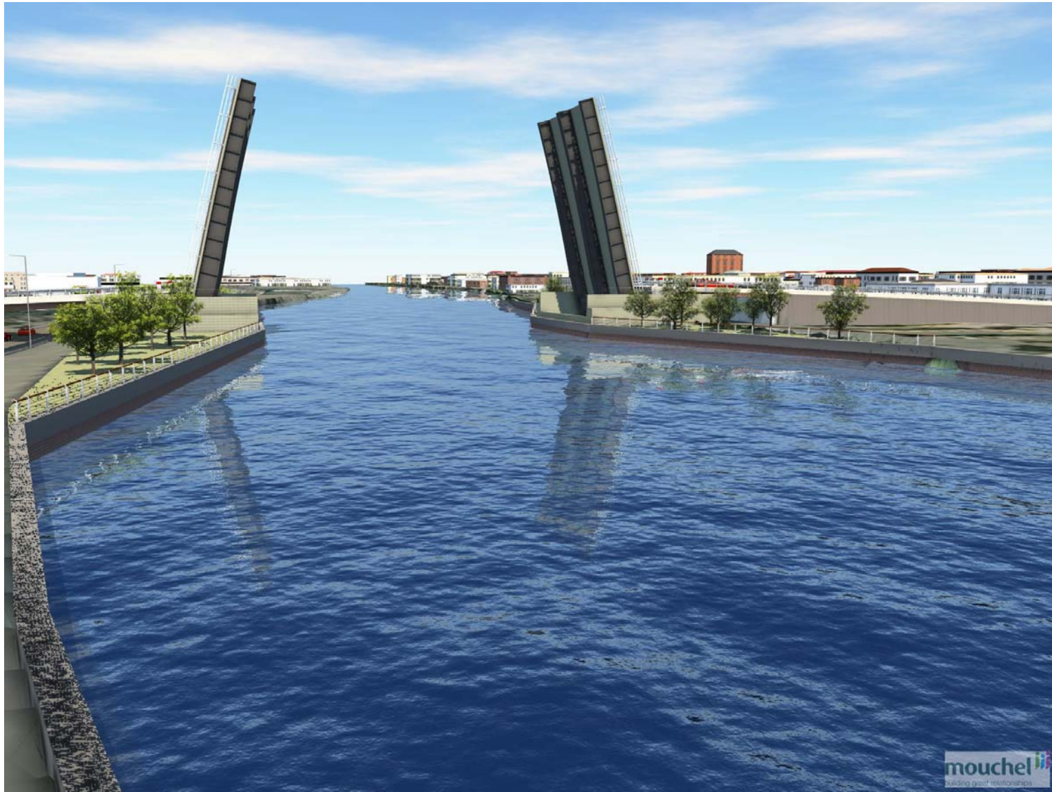
Visual 6: The bridge in its raised position, viewed from the quay wall, looking north.