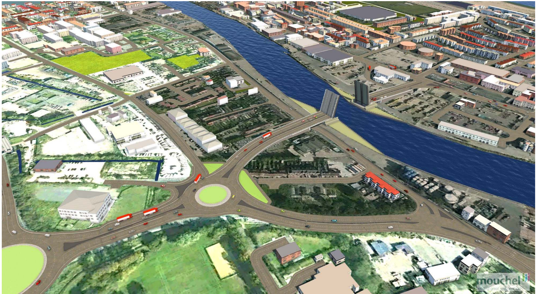
Visual 1: The scheme from its junction with Suffolk Road, across the River Yare to its junction with South Denes Road, looking east.