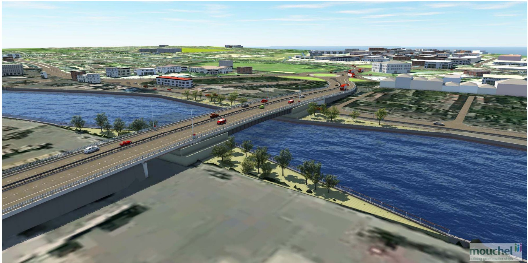
Visual 4: The bridge across the River Yare and Souttown Road, looking west towards the new Suffolk Road roundabout.