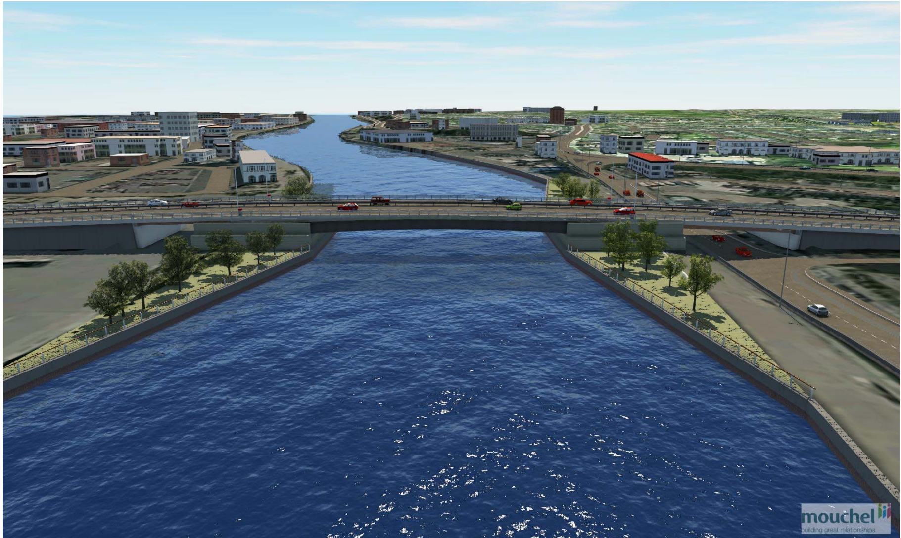
Visual 3: The bridge in its down position, looking south.