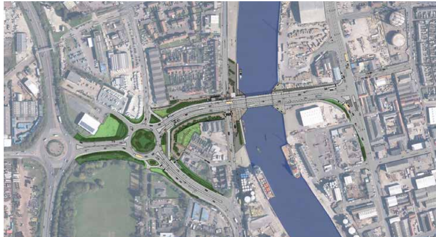
Masterplan of Proposed Scheme with Below Deck Counterweight Option

The existing quay at Southtown Road sits above street level however part of the quay area has been incorporated into the scheme to create Bollard Quay: a new riverside public space associated with the new bridge structure. Proposed levels within the space will be designed to improve the relationship between street and riverside edge providing integrated accessible step and ramped access to the upper level that overlooks the river. The type of mechanism developed for the double leaf bascule bridge will determine the footprint of the support structures on Bollard Quay and inform the final design of the public space and connecting walking and cycling routes