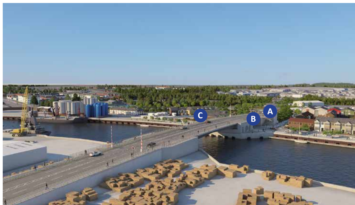
Provisional Control Tower Locations With below Deck Counterweight Option

Three provisional locations (A, B, C) have been identified for the control tower. The control tower location and design is dependent on the bridge and mechanism design and will be developed in tandem with these components. This is to maintain flexibility for the DCO and ensure all components fit with the functionality and aspirations of the Proposed Scheme.