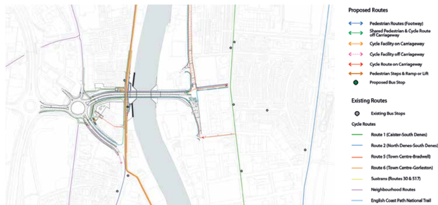
Proposed Scheme and Wider Cycling Network

A network of walking and segregated cycle routes are linked by a combination of controlled and uncontrolled crossings at locations to encourage walking and cycling journeys. Southtown Road is an important north-south link supporting nine bus routes and the scheme provides the opportunity to improve the bus stop provision.