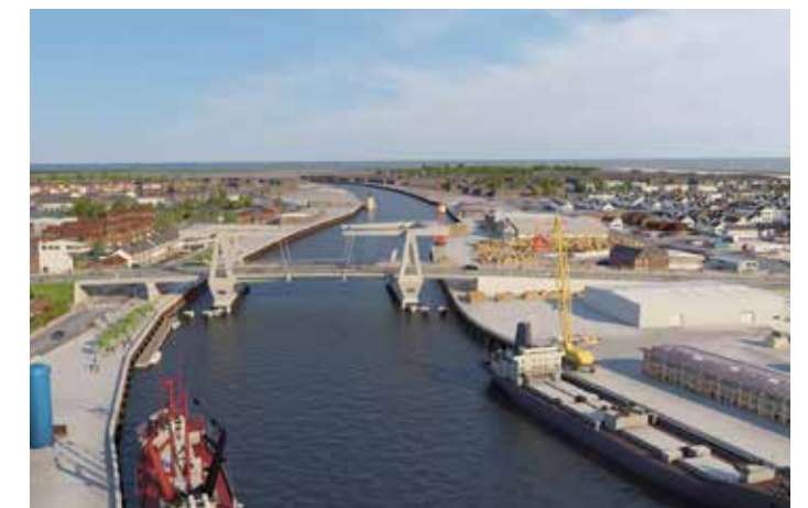
Above Deck Counterweight (possible illustrative design)