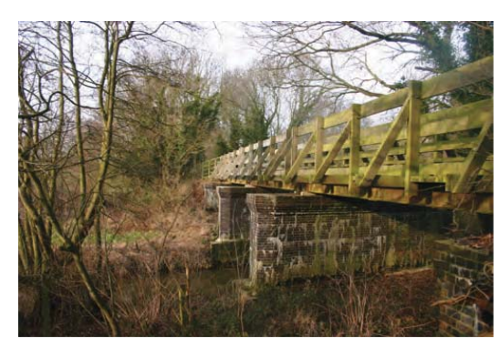
Weavers' Way over North Walsham and Dilham Canal