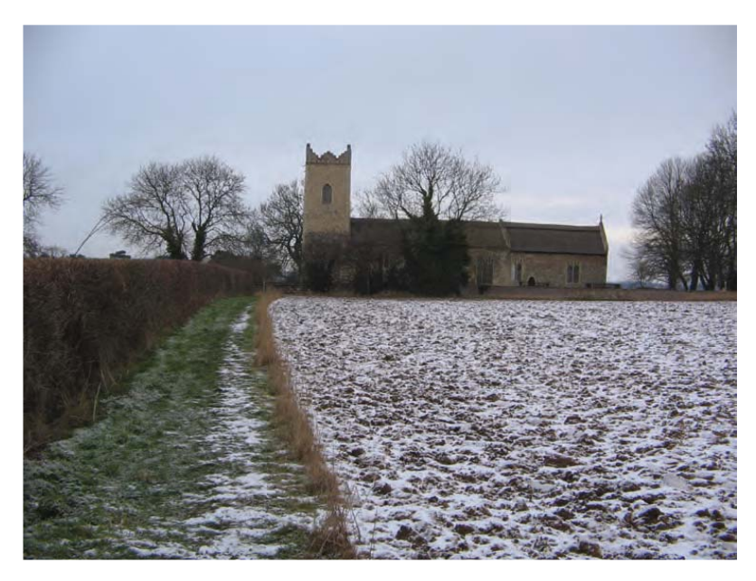
St Edmund's Church, Thurne