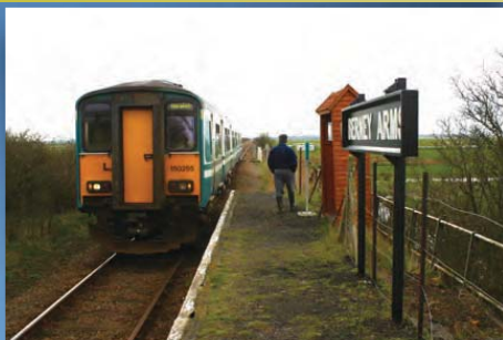
Berney Arms Station