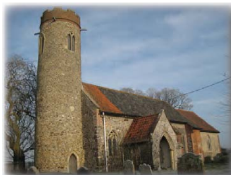
St Peter and St Paul's Church, Sustead