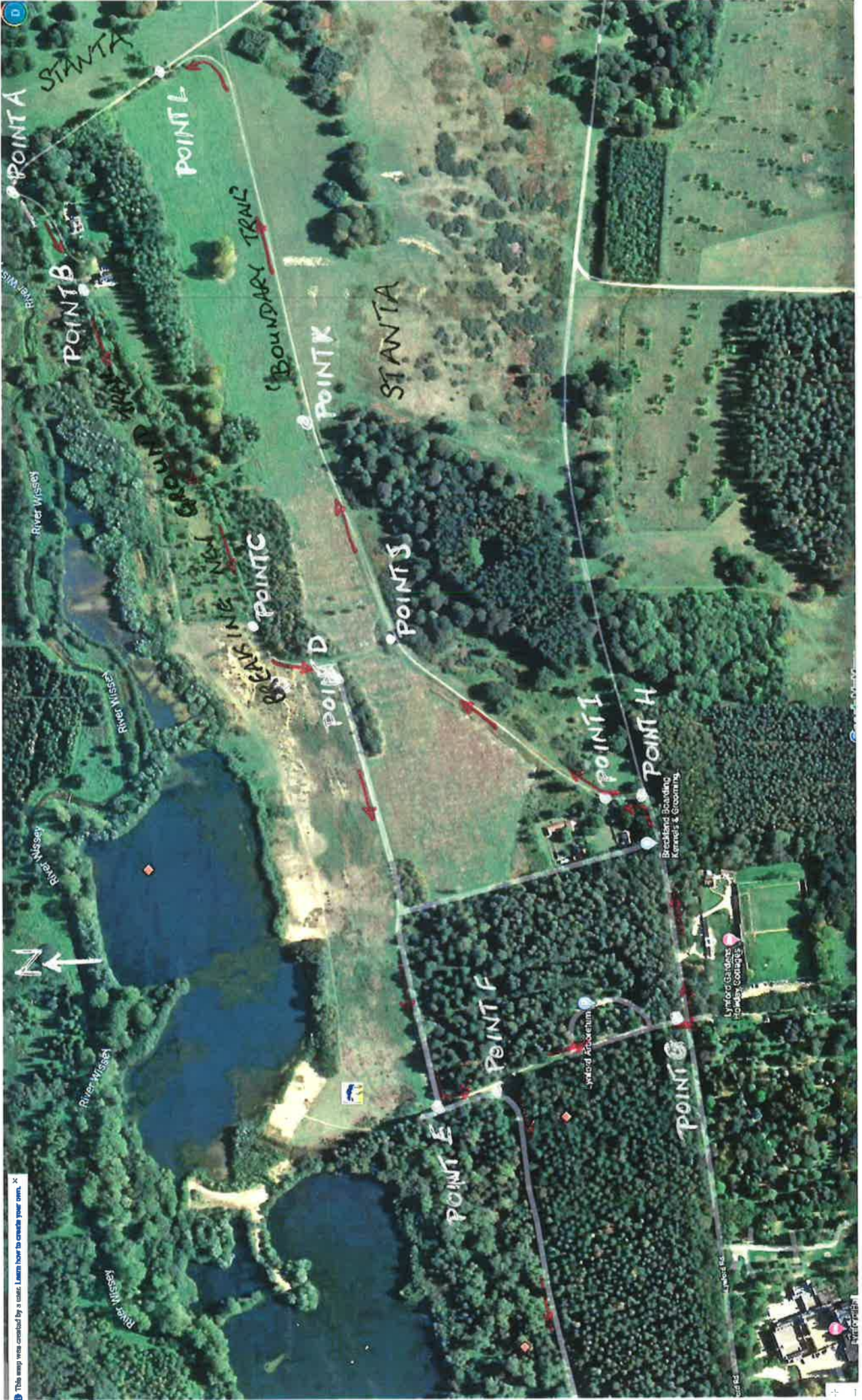
FIGURE 1A. GOOGLE MAPS SATELLITE VIEW. LYNFORD LACES EAST, SHOWING (1) THE BREAKING NEW GROUND TRAIL, AND (2) THE BOUNDARY TRAIL.