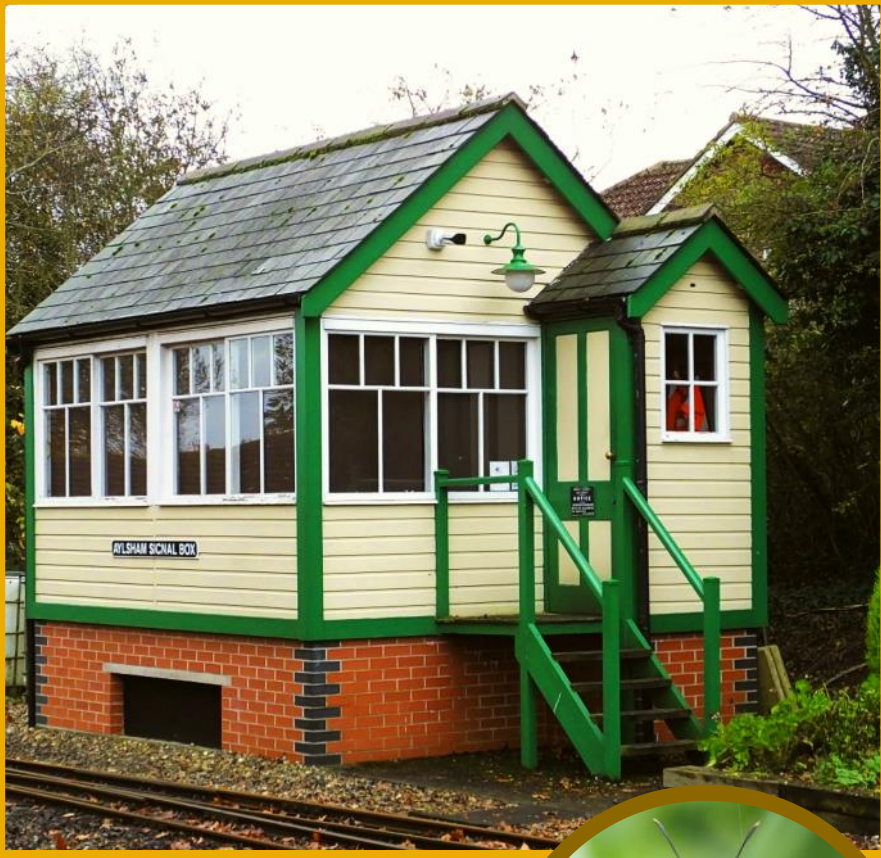
Square: signal box at the Bure Valley Railway. Circle: a woodland ringlet butterfly.

The original station buildings here were demolished in 1989. Since then staff and volunteers of the Bure Valley Railway have replaced the lost Victorian railway with a narrow gauge track. Look out for the tunnel, signal box and real steam trains.