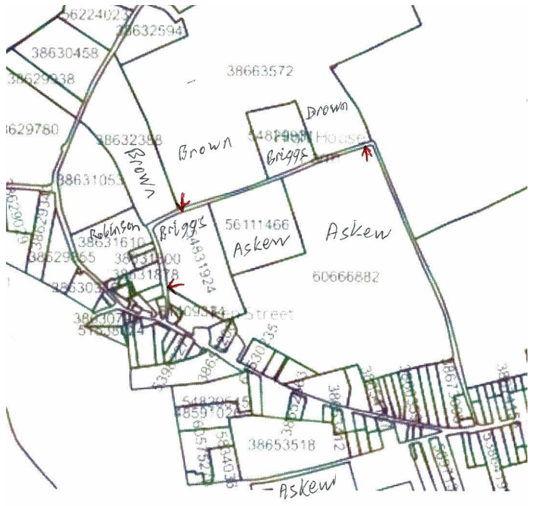
The following map is of the western end of Rags Lane and shows the positions of the houses and landowners there. Also the positions of two of the notices ("To whom it may concern") tied to trees or posts beside the path.