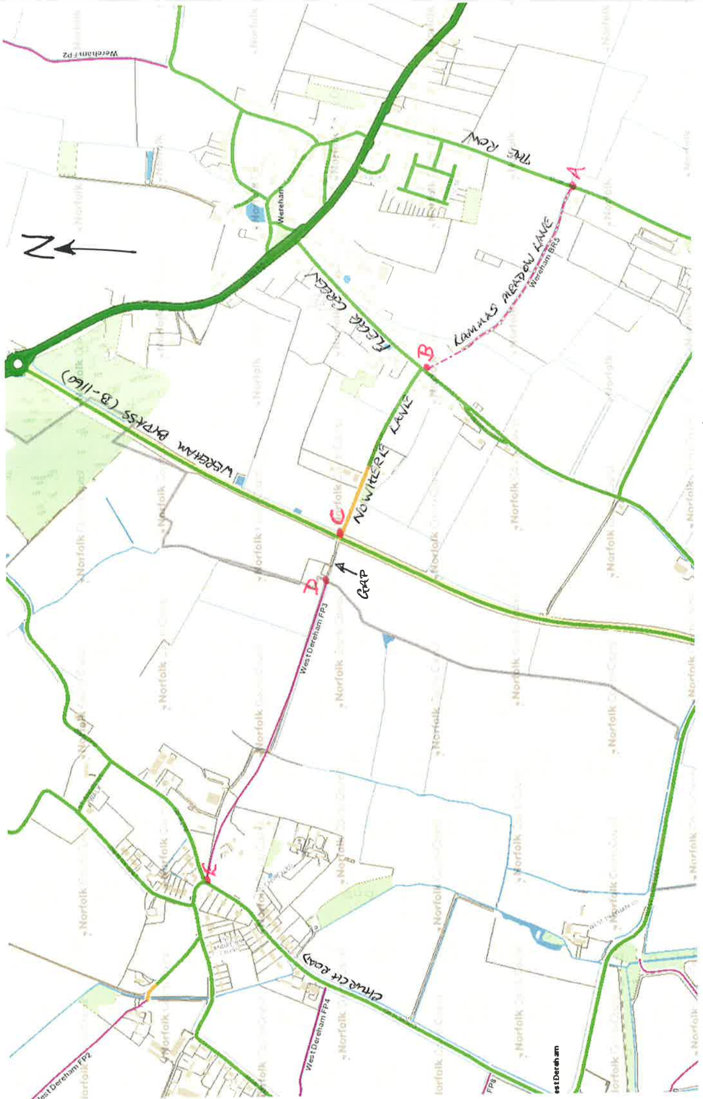
FIGURE 3. N.C.C. NORFOLK HIGHWAYS INTERLUDE T.R.O.W. WRETHAM, 2020.