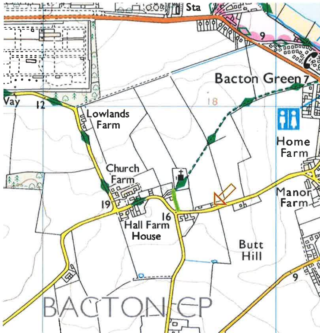
The route which is the subject of the application is shown on the above map by means of a green line

Copyright, Designs and Patents Act 1988 Section 46 This copy is made for the purposes of initiating a statutory inquiry and so does not infringe copyright. Further copies should not be made.