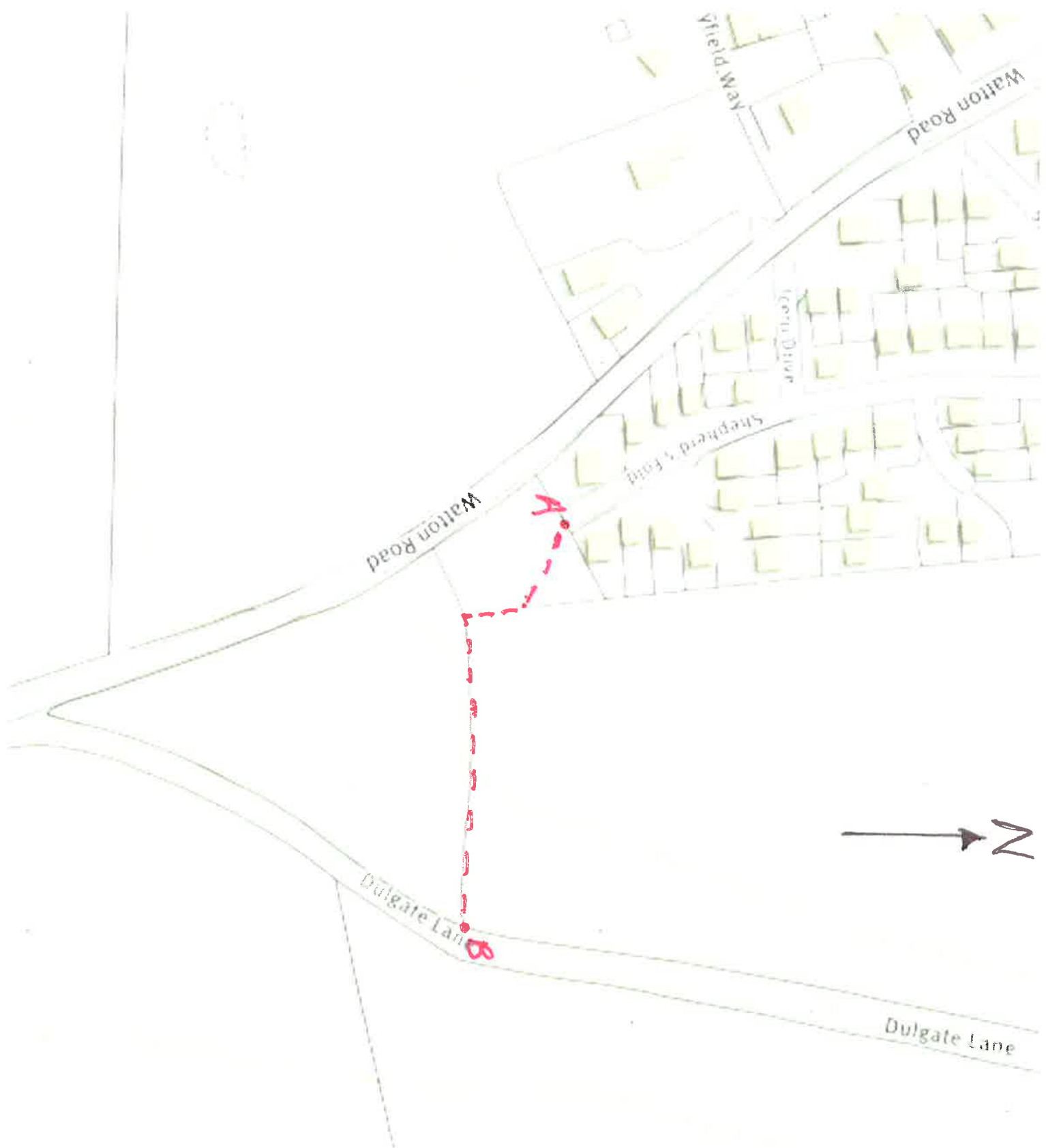
FIGURE 3. ORDNANCE SURVEY ONLINE MAP, 2019 RED DASHED-LINE OF APPLICATION FOOTPATH.