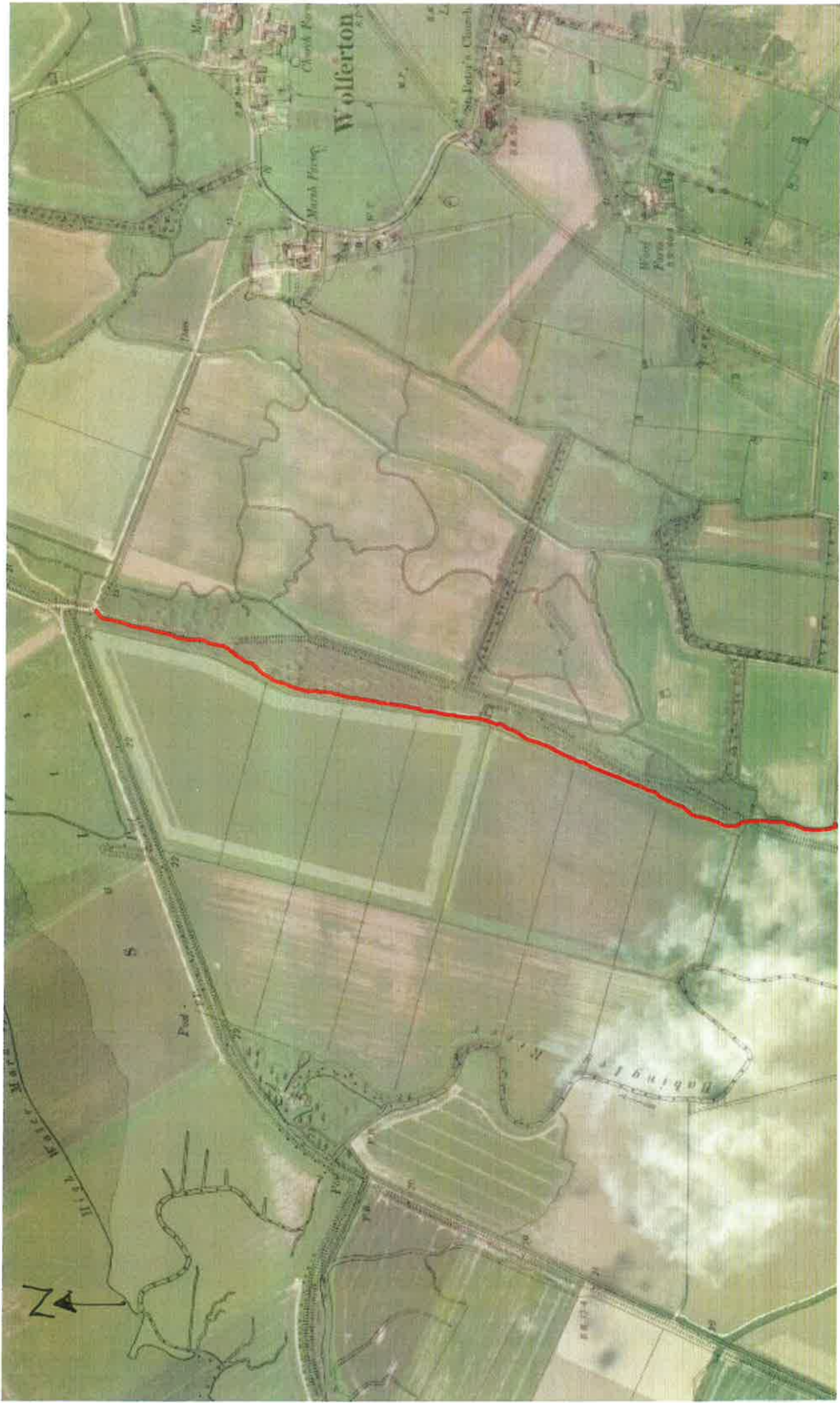
FIGURE 1A. ANNOTATED ROUTE. ORDNANCE SURVEY 6-INCH MAP OF EAST WOOTTON, NORFOLK SHEET 22NE, 1886, SUPERIMPOSED UPON A MODERN ESRI TILE MAP. RED LINE = ROUTE OF FORMER SANDRINGHAM FFS