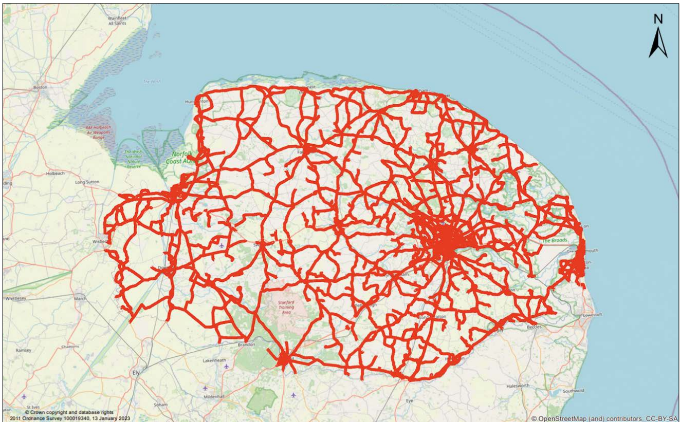
An aerial view of Norfolk showing Norfolk County Council's priority gritting routes.

Public communication of agreed actions is delivered via our Facebook and Twitter social media channels. Other supporting Winter information including a detailed map of gritting routes (see below) is published on the NCC website under 'gritting' Gritting - Norfolk County Council .