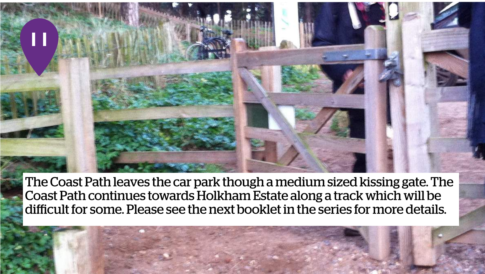
The Coast Path leaves the car park through a medium sized kissing gate. The Coast Path continues towards Holkham Estate along a track which will be difficult for some. Please see the next booklet in the series for more details.