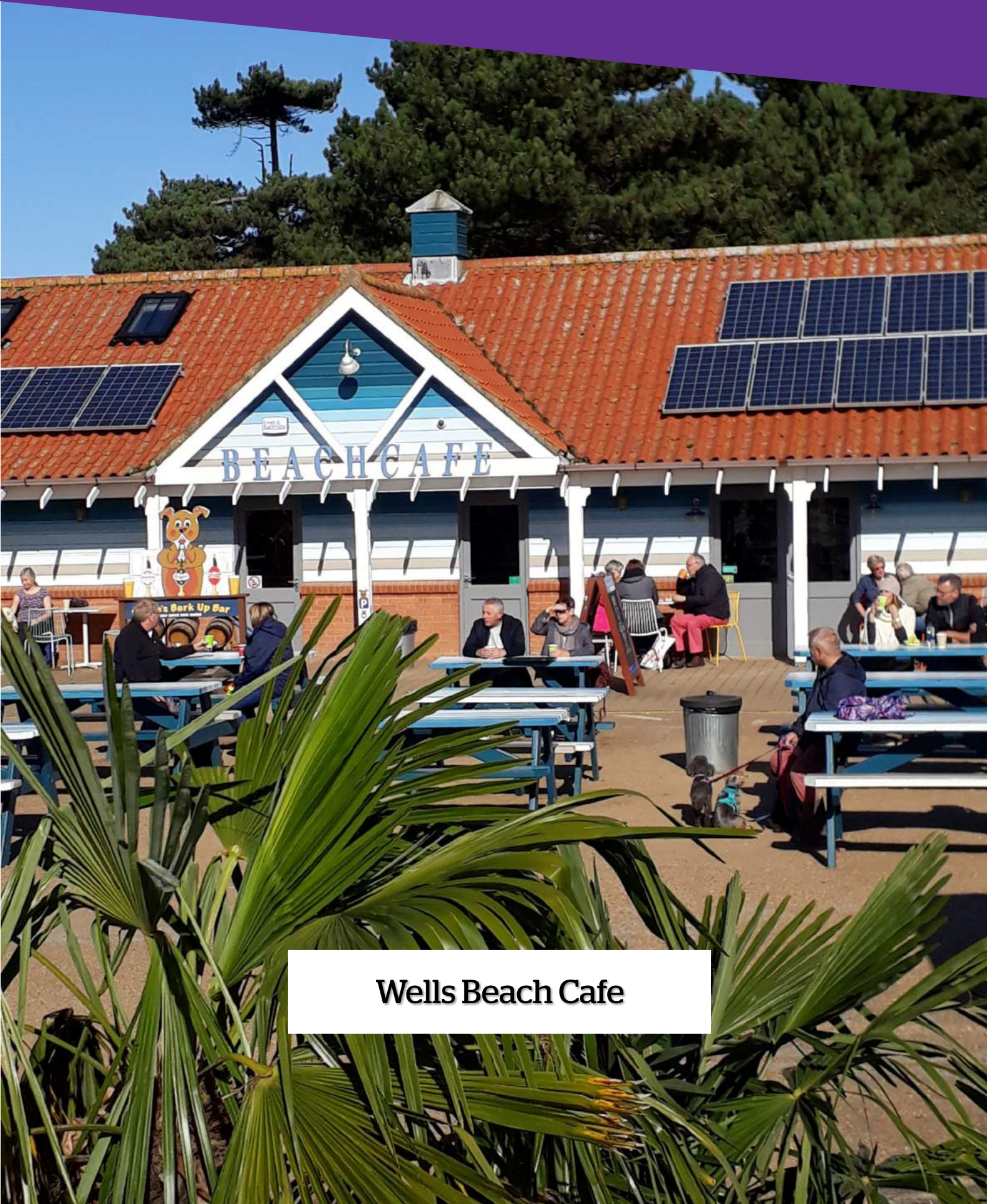
Wells Beach Cafe