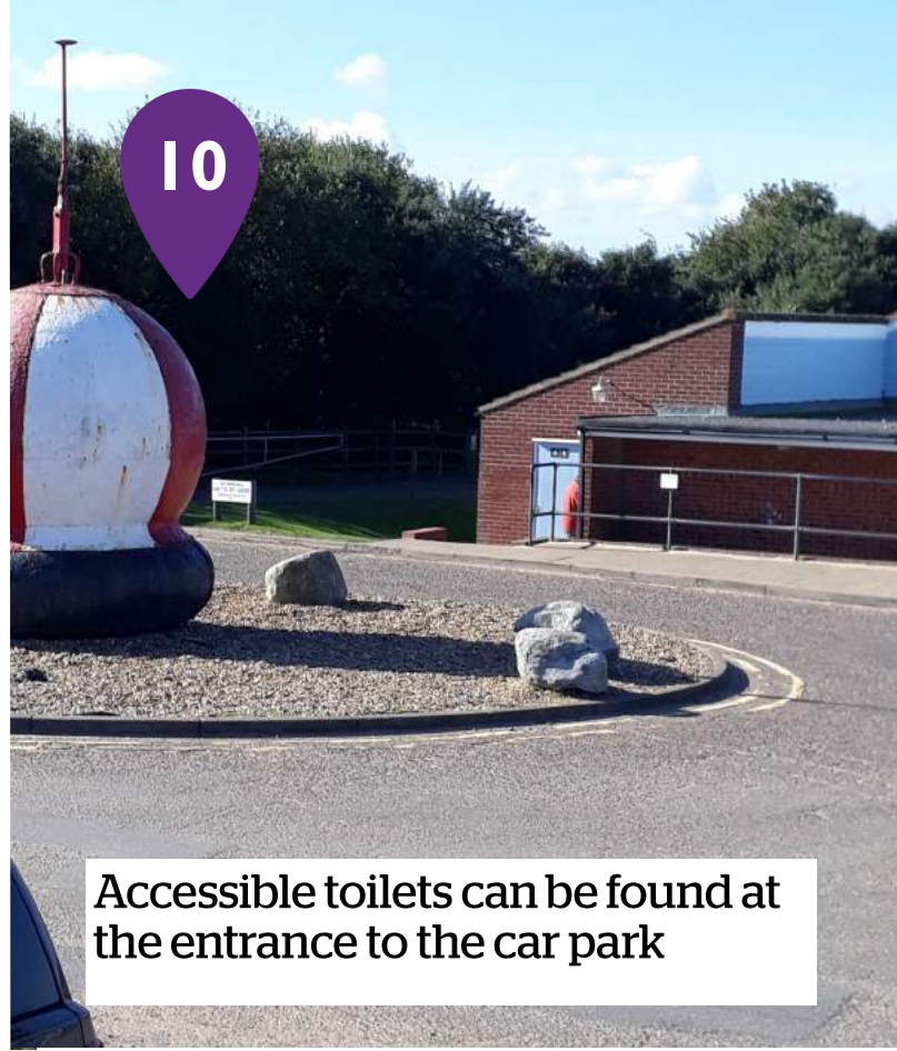
Accessible toilets can be found at the entrance to the car park