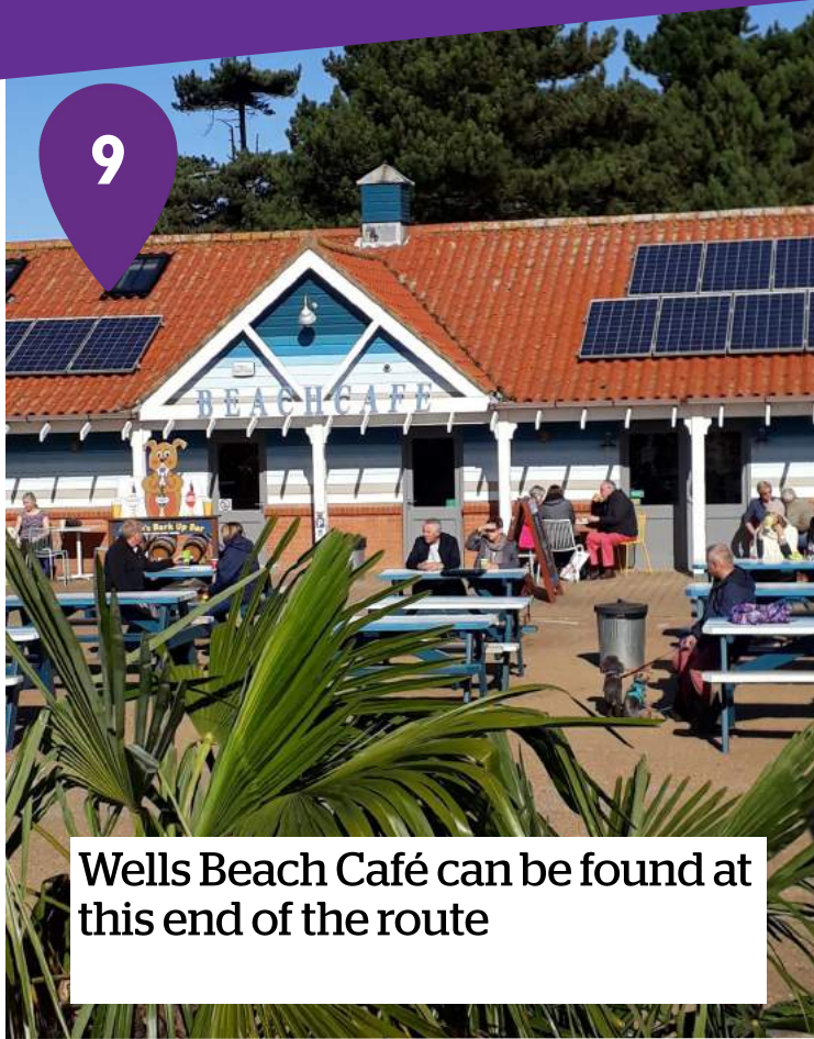
Wells Beach Café can be found at this end of the route