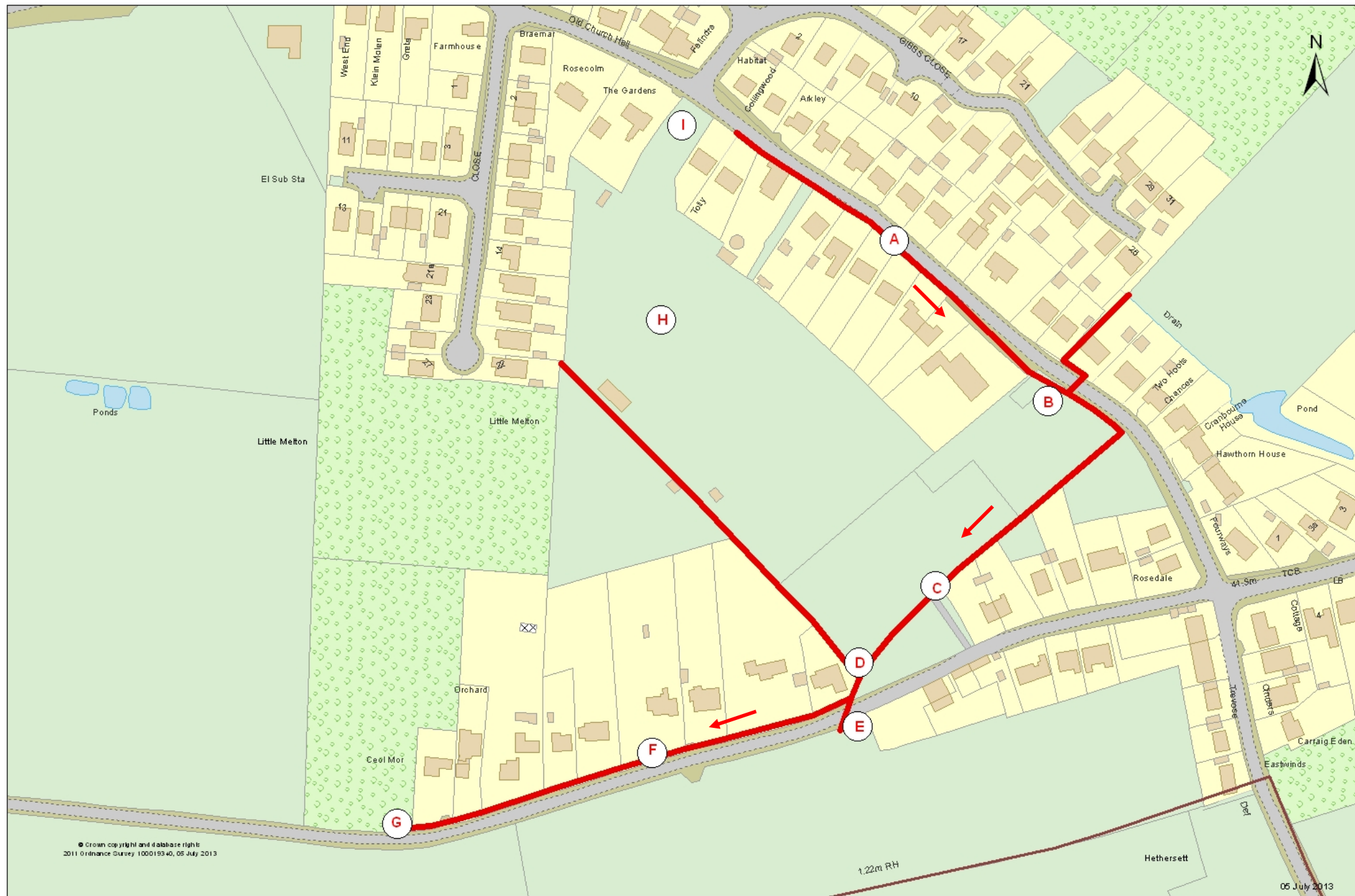
Drainage system Little Melton